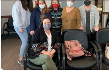
CADV Staff getting vaccinated.