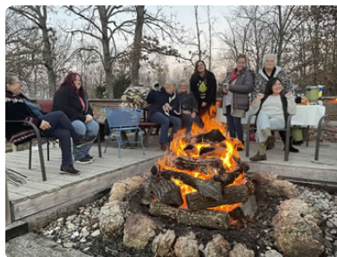
CADV Staff enrichment activity!