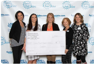
Community Foundation of the Lake Donations - thank you!!!!